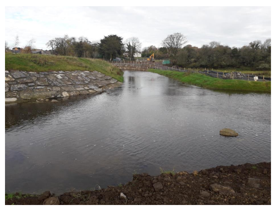
Figure 1; Upstream of Bypass Channel