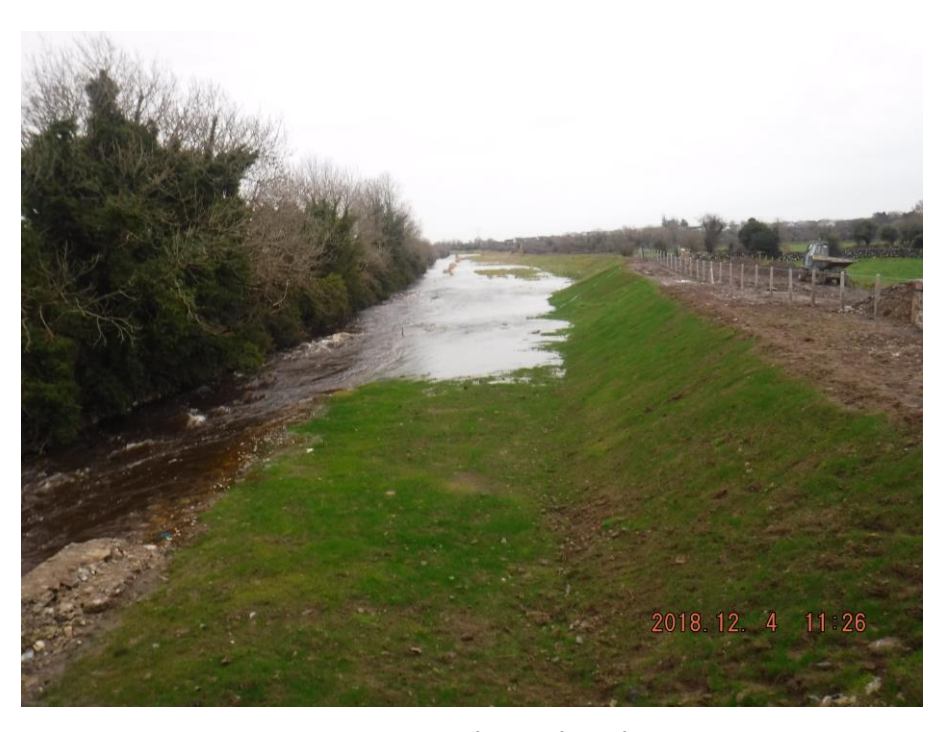
Figure 3; Second Stage Channel