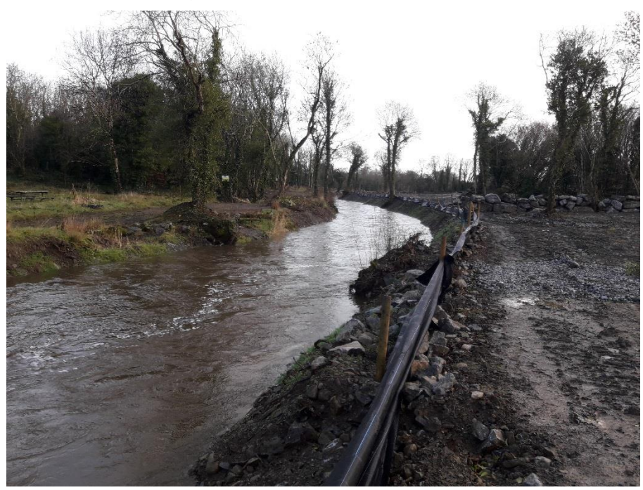
Figure 4; Regrading of Dunkellin complete

The re-grading of the Dunkellin River complete.