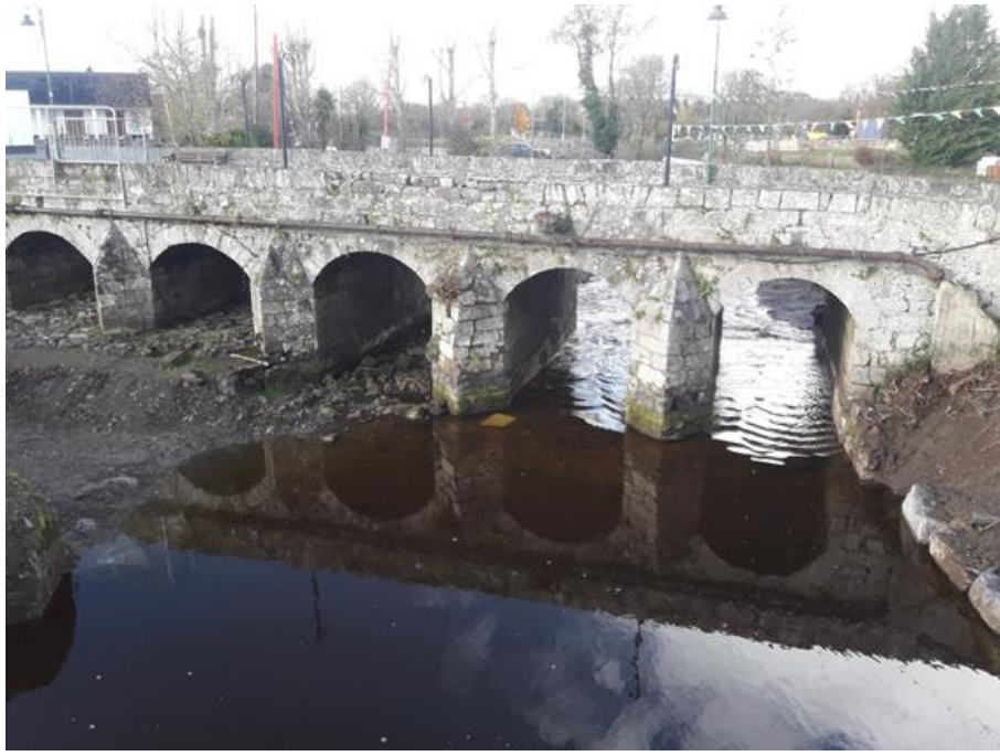
Figure 6; Regrading of Dunkellin complete

Underpinning works of the Pedestrian Multi Arch Bridge in Craughwell village is under review and will be programmed when design is finalised.