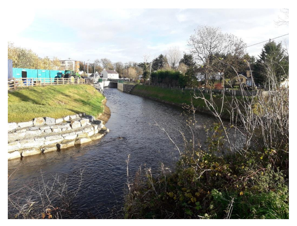
Figure 2; Downstream of Bypass Channel