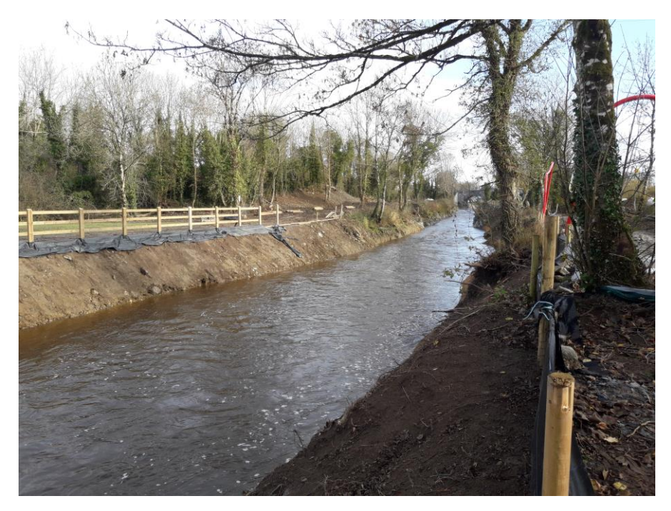
Figure 5; Regrading of Dunkellin complete