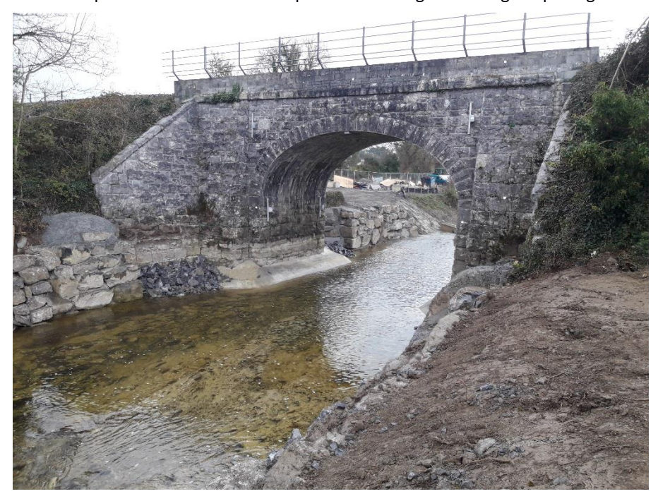
Figure 7; UB154 Railway Bridge

Construction of a concrete apron at each abutment to protect the bridge following deepening works is complete.