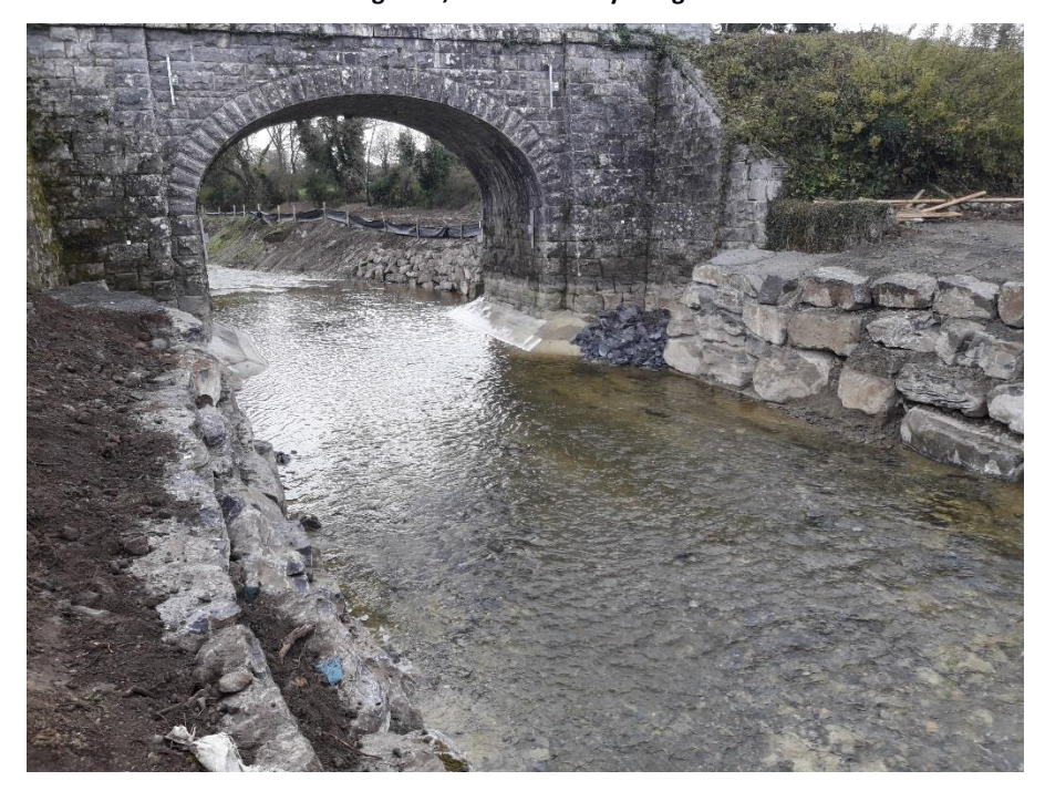
Figure 8; UB154 Railway Bridge